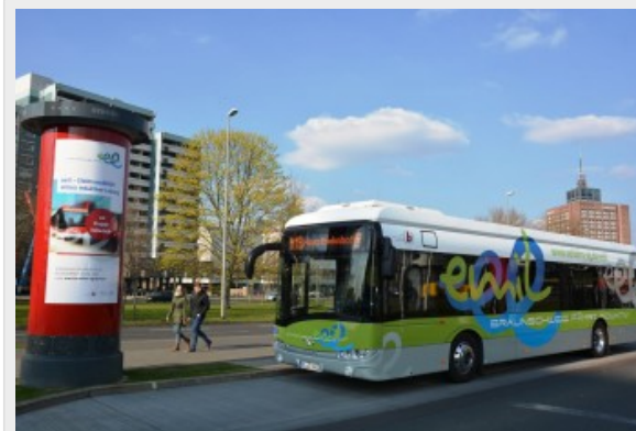
12m Solaris battery-electric bus with the PRIMOVE inductive charging system from Bombardier

Interesting is the receiver, which has some kind of undercarriage pantograph-like mechanism to reduce the distance to the ground charging pad.