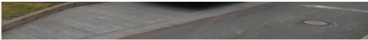
12m Solaris battery-electric bus with the PRIMOVE inductive charging system from Bombardier

Recently, Braunschweiger Verkehrs from Brunswick, Germany got the first 12m Solaris electric bus, equipped with Bombardier PRIMOVE inductive charging.